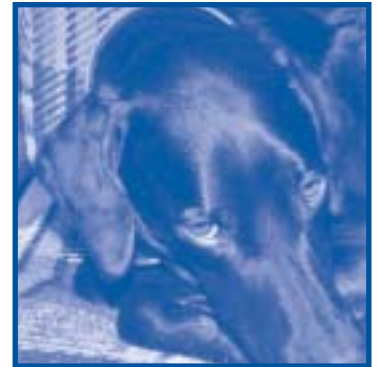
I'm not moving for anybody!