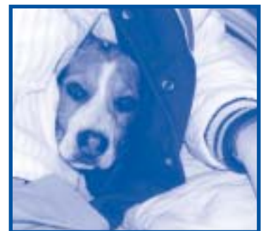
Don't neglect your pet over the winter period - he needs a cuddle too!

We hope the above suggestions will help to keep both the pet and family sane during the colder weather period and those 'indoor activity' days.