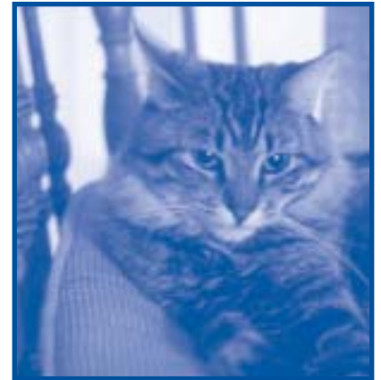
Older pets a good choice for the elderly owner

Grooming can sometimes be a problem for older people with arthritis, so in these cases, long-coated dogs and cats are not a good choice unless the owner can afford to send them to a grooming salon.