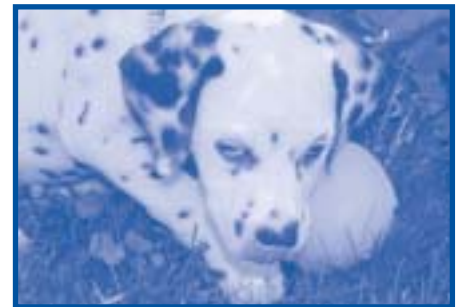
Care should be taken when choosing a toy for your pet.

So if you don't already, treat your pets like your children by providing a safe environment and entertainment.